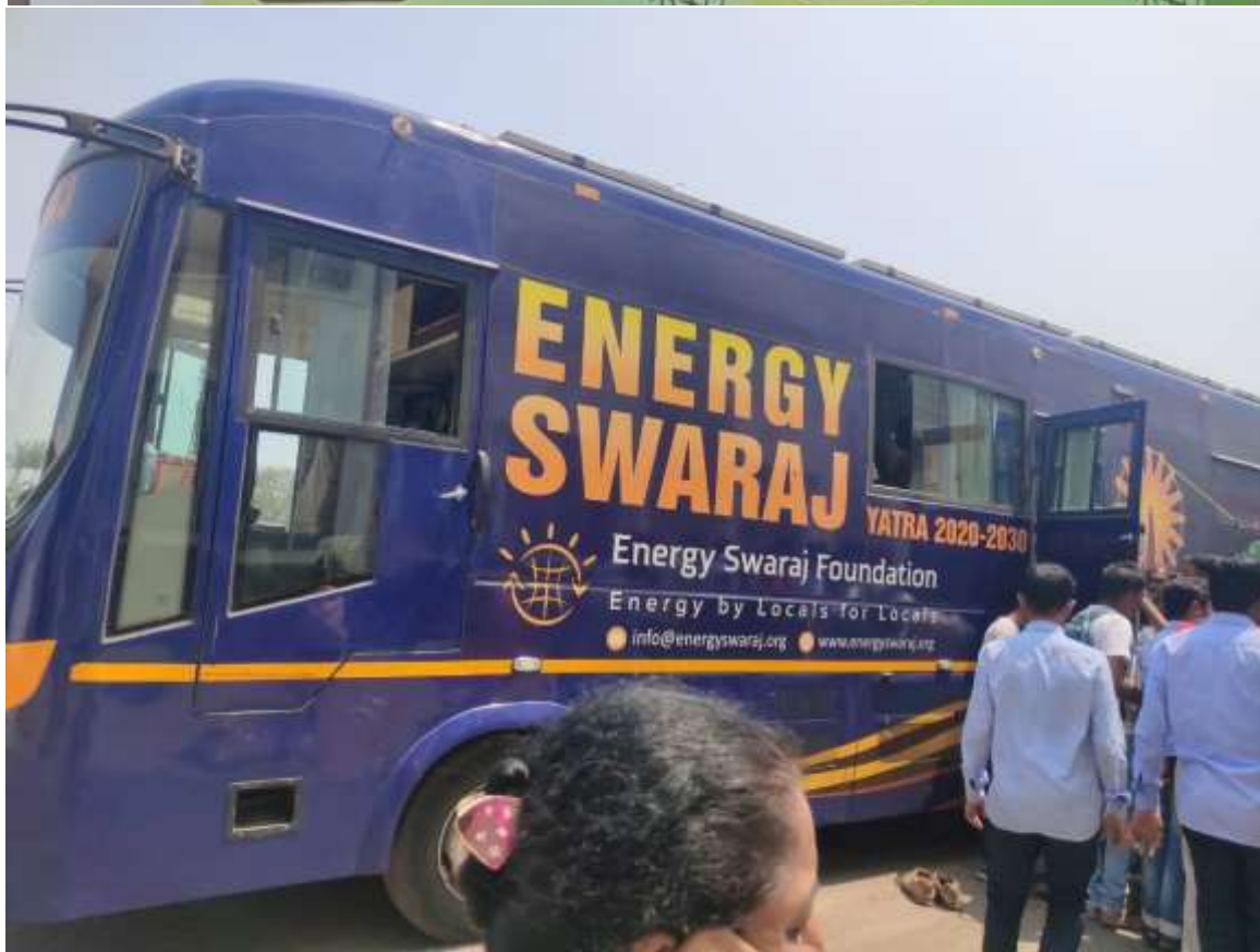
Energy Swaraj Yatra